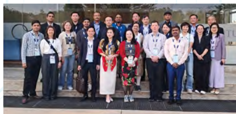
Trident Infosol Private Limited