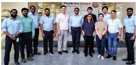
CENTUM Electronics Limited